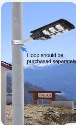
Embrace hoop installation