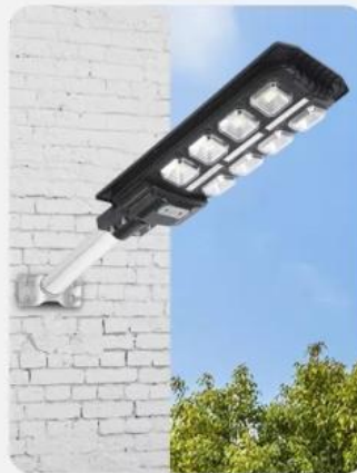
Automatic charging during the day