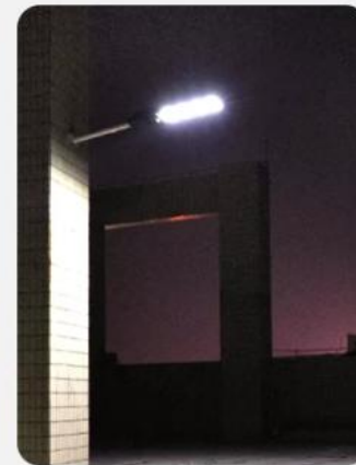
Automatic light at night