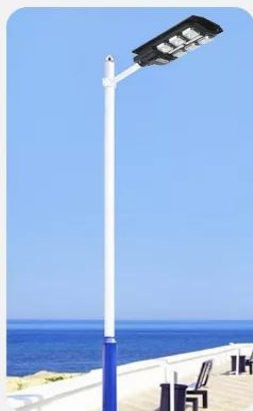
Bar type installation